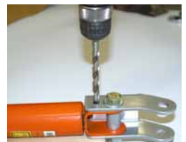
Photo # 33